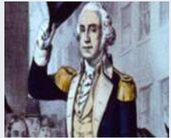
Climbing Military Ranks 1