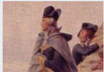
Early War Experience 1